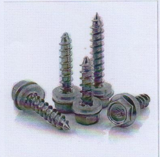
Screw image for wood lathing