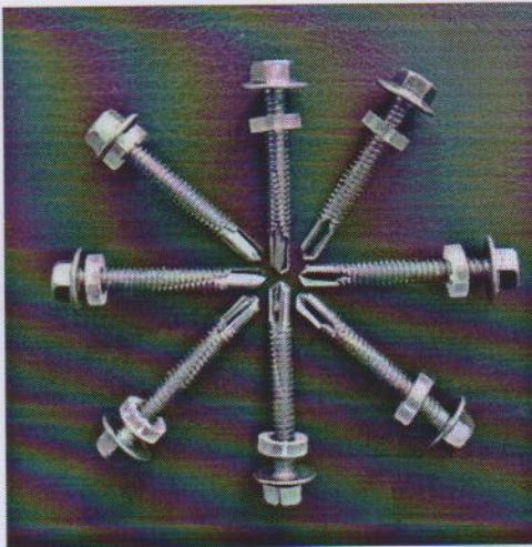
Screw image for steel lathing